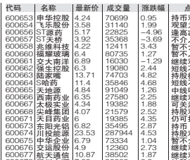
沪指 收盘 2651.37 成交额 444.55 亿