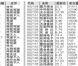
深市 收盘 9162.11 成交额 220.87 亿