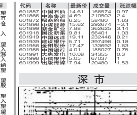
深市 收盘 9162.11 成交额 220.87 亿