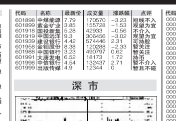
B股 2026.70 涨跌 -0.48